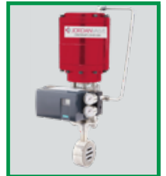
MK75A/75E Sliding Gate