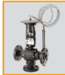
Mark 89 3-way Temp Reg