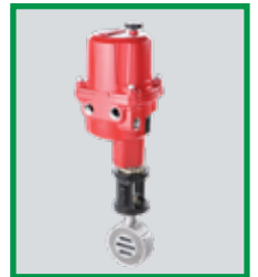
Mark 75MV Sliding Gate