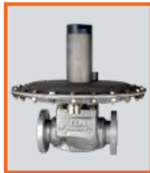
Mark 608 Balanced Plug