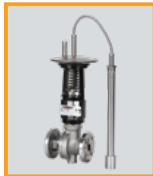
Mark 80 Temp Regulator