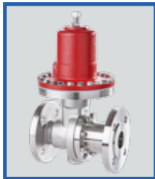
Mark 50 BPRV