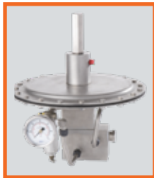
Mark 695 Piloted