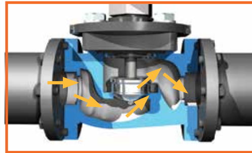
Flow changes direction three times