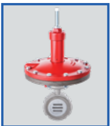
Mark 575 BPRV/675 PRV