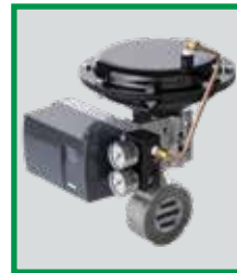
Mark 75 Sliding Gate