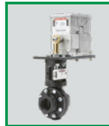
Mark 33 Sliding Gate