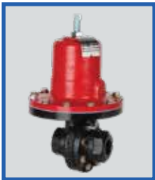
Mark 60 PRV