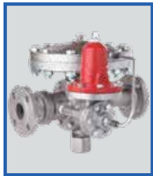
Mark 57 BPRV/67 PRV