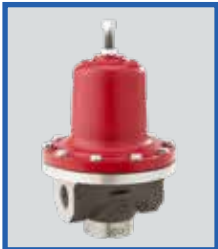
Mark 58 BPRV/68G PRV