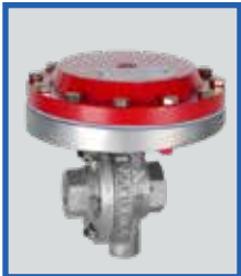
Mark 56 BPRV/66 PRV