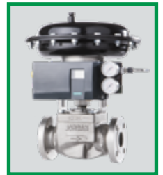
Mark 78 Globe